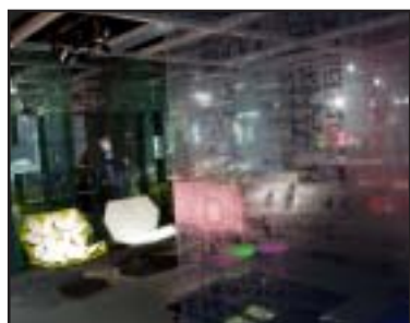
Household exhibition, photo courtesy La Presse

Classic and modern furniture solutions; products and services for the house and the wedding day. Admission fee: Fri 3 euro; Sat - Sun 7 euro. Free entrance for children up to 12 years. For more details in English visit http://www.home-gallery.it/hg_english/evento_eng.asp .