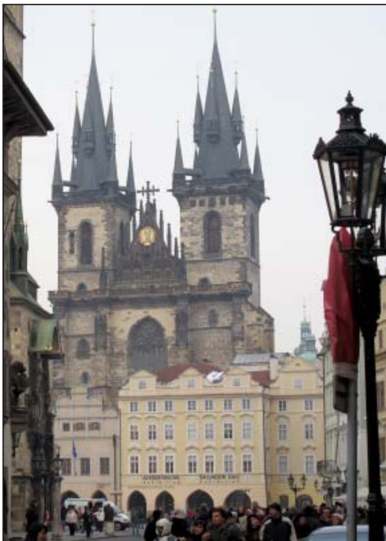
Churches dot the landscape and usually open onto pedestrian squares lined with shops and stalls.

Prague offers sights and activities for all tastes and ages. With a small amount of research and an open mind, the city offers a great way to spend the weekend.