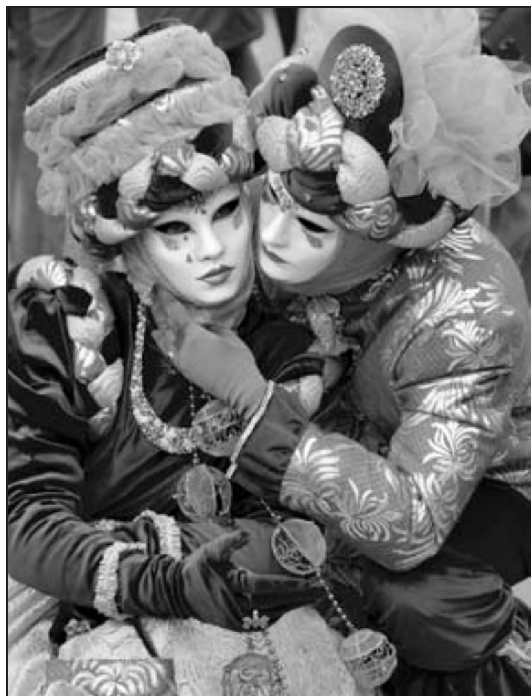
Canavale in Venice especially, draws crowds of lavishly costumed participants.

Antique Indian Dances , Feb. 1, 6 p.m., in Vicenza , Ganapati Yoga Center, Stradella