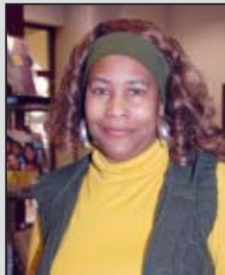
A.R. Jones Post library

"I'm going to teach my kids about Black History and the history before the Mayflower."