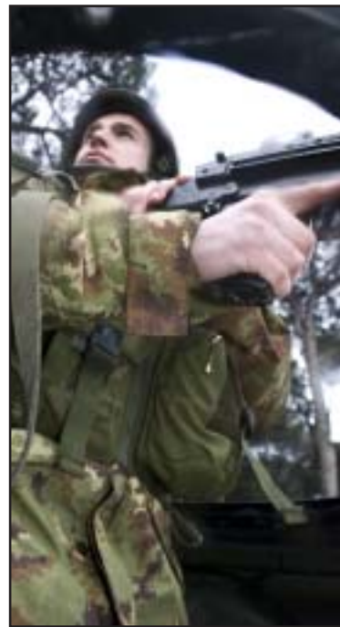
An Italian Folgore scans the horizon from the machine-gunner position for improvised-explosive-devices and enemy combatants during a joint training exercise on Camp Darby.

Training areas available Camp Darby has two local training areas. They were heavily utilized in the 1990s by National Guard engineers and troops in Europe. Units interested in using the training areas should call Director of Plans, Training, Mobilization and Security at 633-8335 or 633-7033.