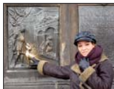
(Top) Cobblestoned streets wind through the old quarters of the city. (Left) Strolling over the Charles Bridge can be done day or night. The bridge hosts artists and musicians on the span as well. (Above) Tourists make a wish on the statue of the martyr John of Nepomuk on the Charles Bridge.